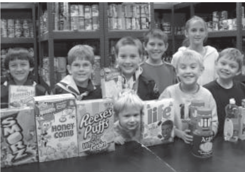
Members of Shaler Cub Scout Pack #157 (plus a supportive sister!) collected food for our pantry and learned how their help makes a difference.

All food pantry donations received between March 1-April 30 qualify for matching funds through the Feinstein Foundation $1 Million Giveaway . To learn more, contact Natalie Klaum at 412-487-6316 or naklaum@nhco.org .