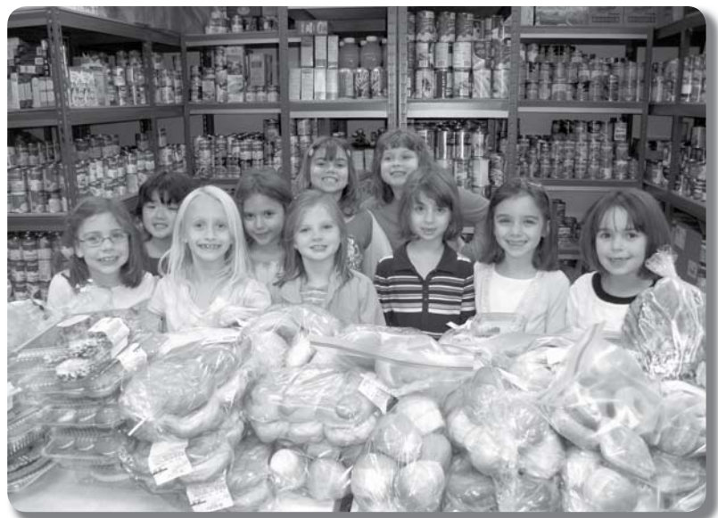
Peebles Elementary Daisy Troop #50453 toured the food pantry when they dropped off a donation.