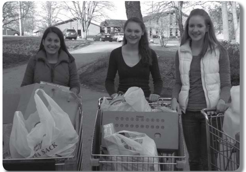
Hampton High English class students collected food for a school project.

NHCO utilizes a holistic, comprehensive approach to helping our neighbors in need. Rare is the case that a hungry person is just hungry. There is almost always more to the story, and we are here to listen and walk alongside people in crisis, hardship and poverty.