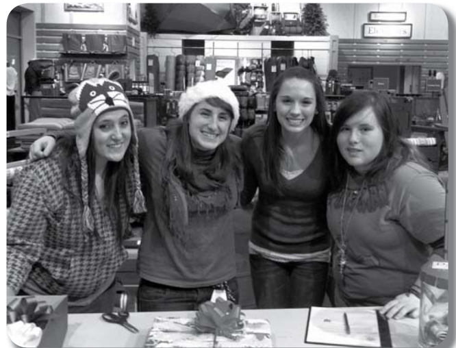
Members of Girl Scout Troop #55 wrapped gifts for donations to our food pantries on Christmas Eve at L.L. Bean.