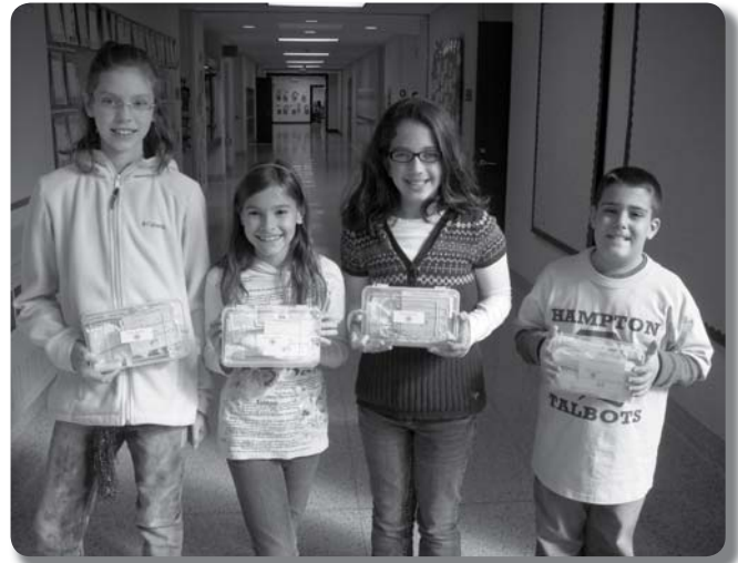
Central Elementary's Kids Care Club assembled and donated 75 first aid kits, which were given to families who use our food pantries.